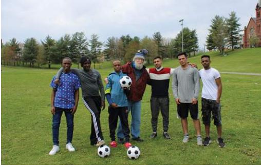
Women participate in weekly volunteer-led sewing group. Youth and volunteers gather for intramural soccer.