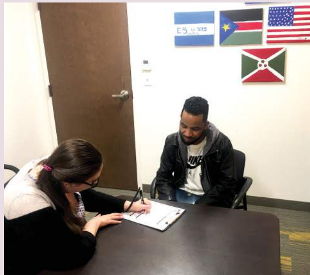
IINE’s professional legal services help refugees and immigrants to access public benefits, work, reunite with family, and stay in the U.S. legally