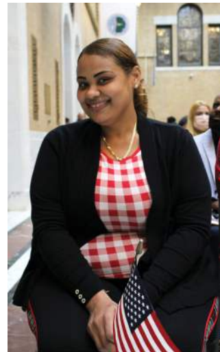
In FY23, IINE's Legal Services team helped 99 legal permanent residents become U.S. citizens