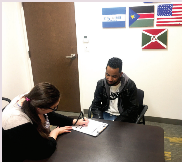
IINE’s professional legal services help refugees and immigrants to access public benefits, work, reunite with family, and stay in the U.S. legally