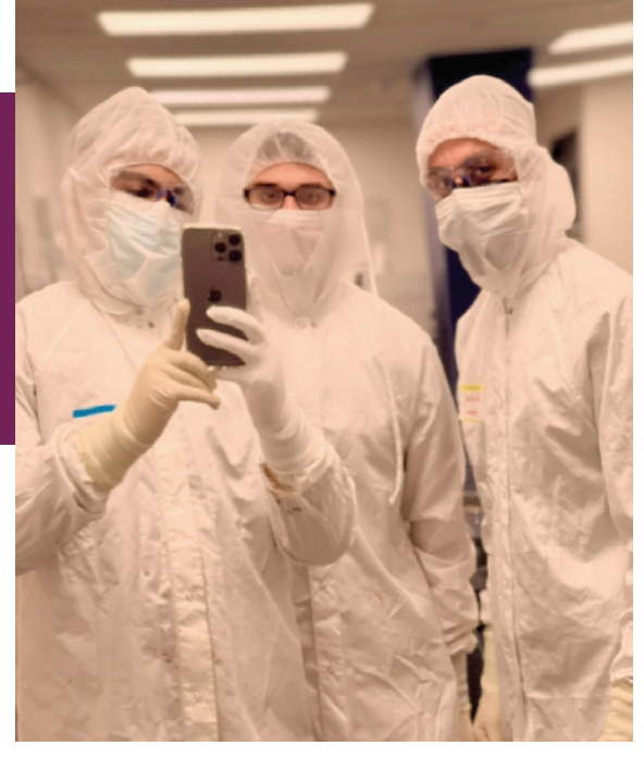
Students in MNPAP construction and maintenance training program receive 12 hours of OSHA safety training.

Next, we turn to our strong network of community partners, including higher education