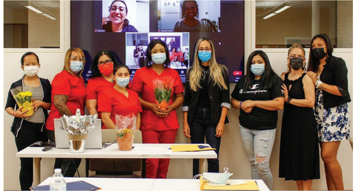
Cohort 6 of the LNA training program celebrate their graduation.

providers and local employers, to find trainers, guest speakers, and apprenticeships. With all of the pieces in place, we are ready to help our clients become job-ready.